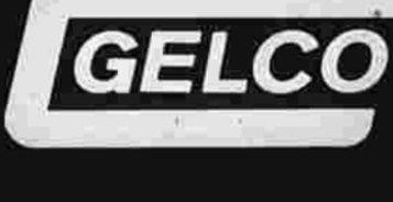
A DIVISION OF S. GELCO & CO. INC. Sole In Effect Wed., July 21 Thru Sun. July 25.