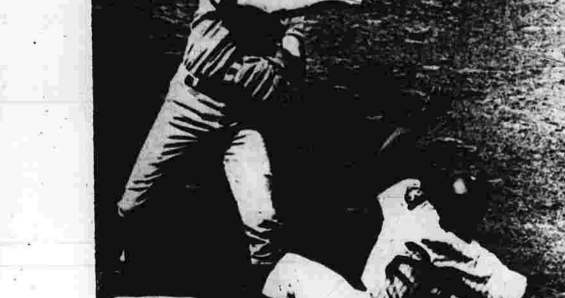
SUPER OUTLOOK — Washington Redskins' leading rusher, Larry Brown, has the Super Bowl as his goal for the Redskins. Brown is shown during practice in the training camp at Carlisle, Pa.