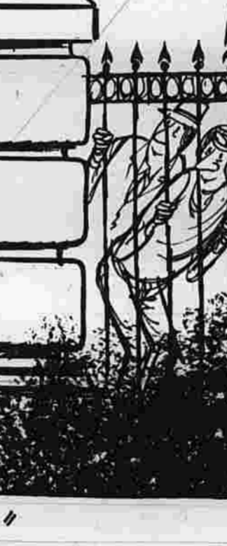
"THEY ALWAYS WHISTLE AT THE GIRLS I DATE"