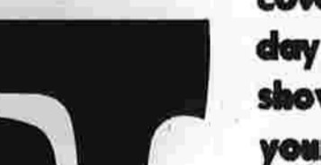
CUSTOM DRAPERY and BEDSPREAD DEPT.