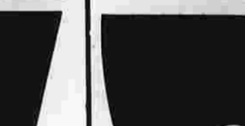
WALL-TO-WALL CARPETING FOR THREE ROOMS