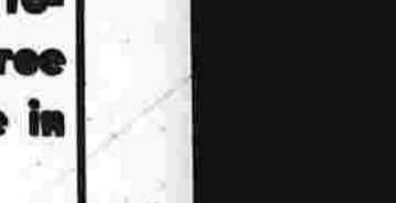
OPEN MON. - FRI. 10-9 SAT. 10-5:30