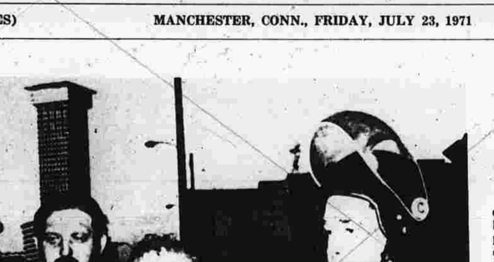
Weeping woman clad in nightgown is carried from scene of fire.