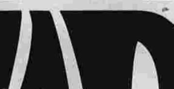
COMPLETE INCLUDES CARPET TACKLES INSTALLATION 50 OZ. PADDING