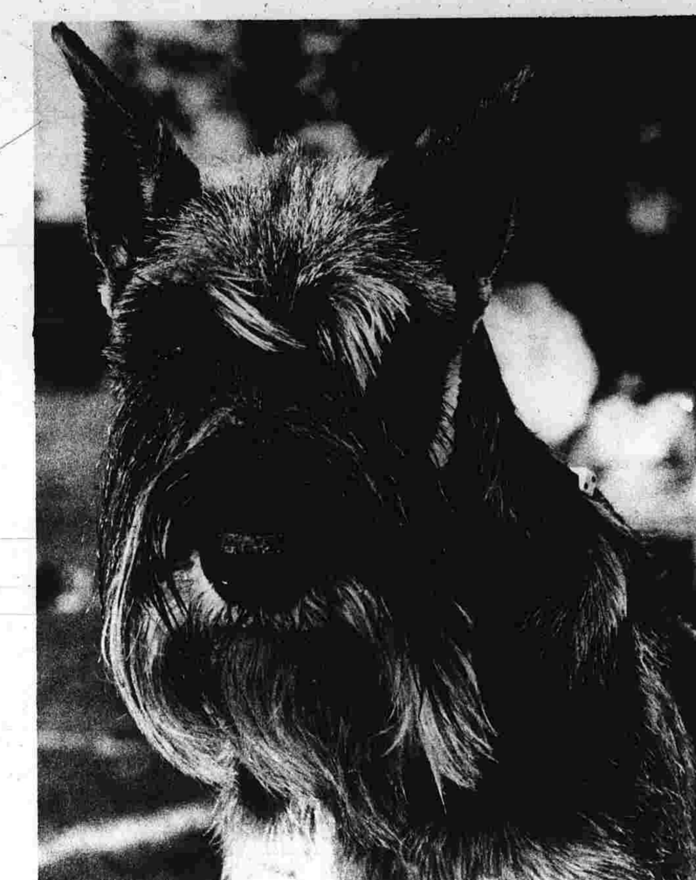
"HEIDI IV": STANDARD SCHNAUZER